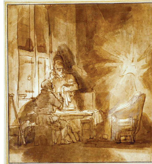
Supper at Emmaus by Rembrandt 1649, at the Fitzwilliam Museum, Cambridge, UK

The Easter Word is a gift for all times and seasons. Even when the circumstances prevent us from fully participating in the Eucharist, we can turn to our Testaments, New and Old, and find the loving Father, the breath of the Spirit and the mind of Christ.